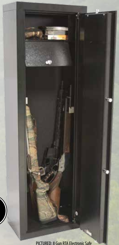
PICTURED: 8 Gun RTA Electronic Safe